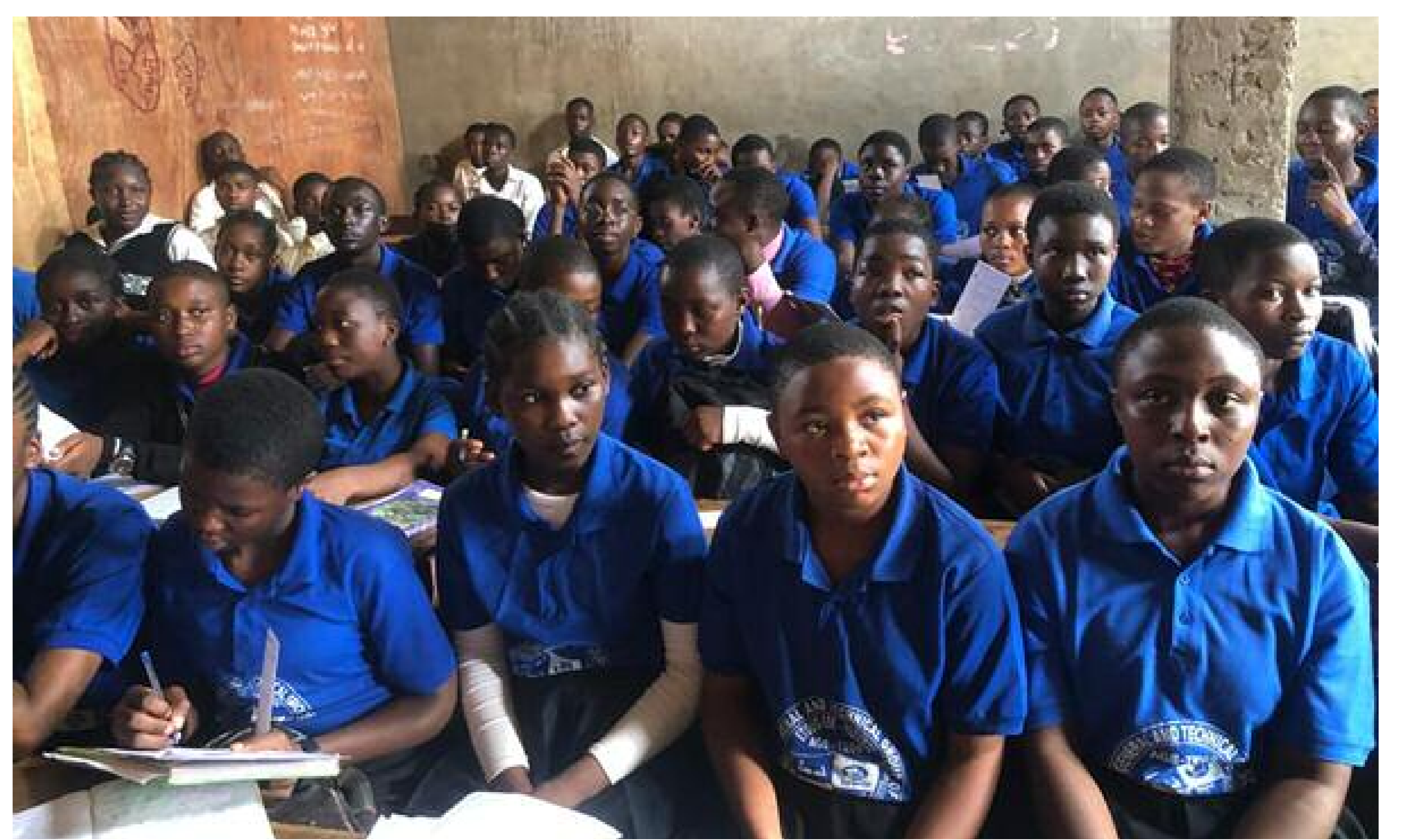
Cross section of students taking part in the lecture