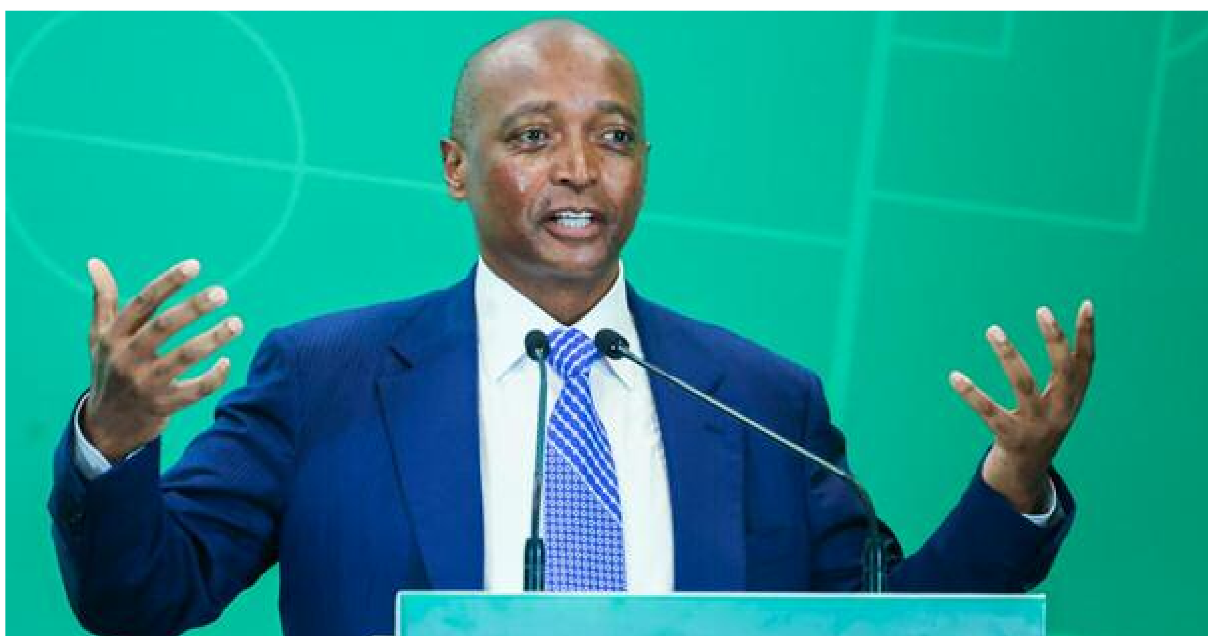
Dr Patrice Motsepe: CAF President

Confederation of African Football president Patrice Motsepe says he would "encourage" an investigation into corruption at the organisation.