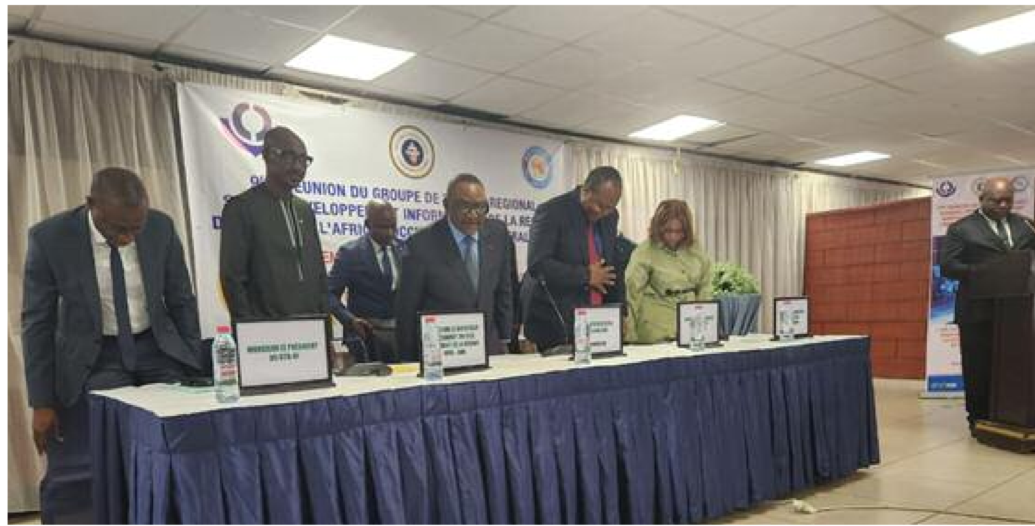
Cameroon Customs DG(middle) during start of regional workshop

He went on "It must be able to combine technological performance and operational efficiency to