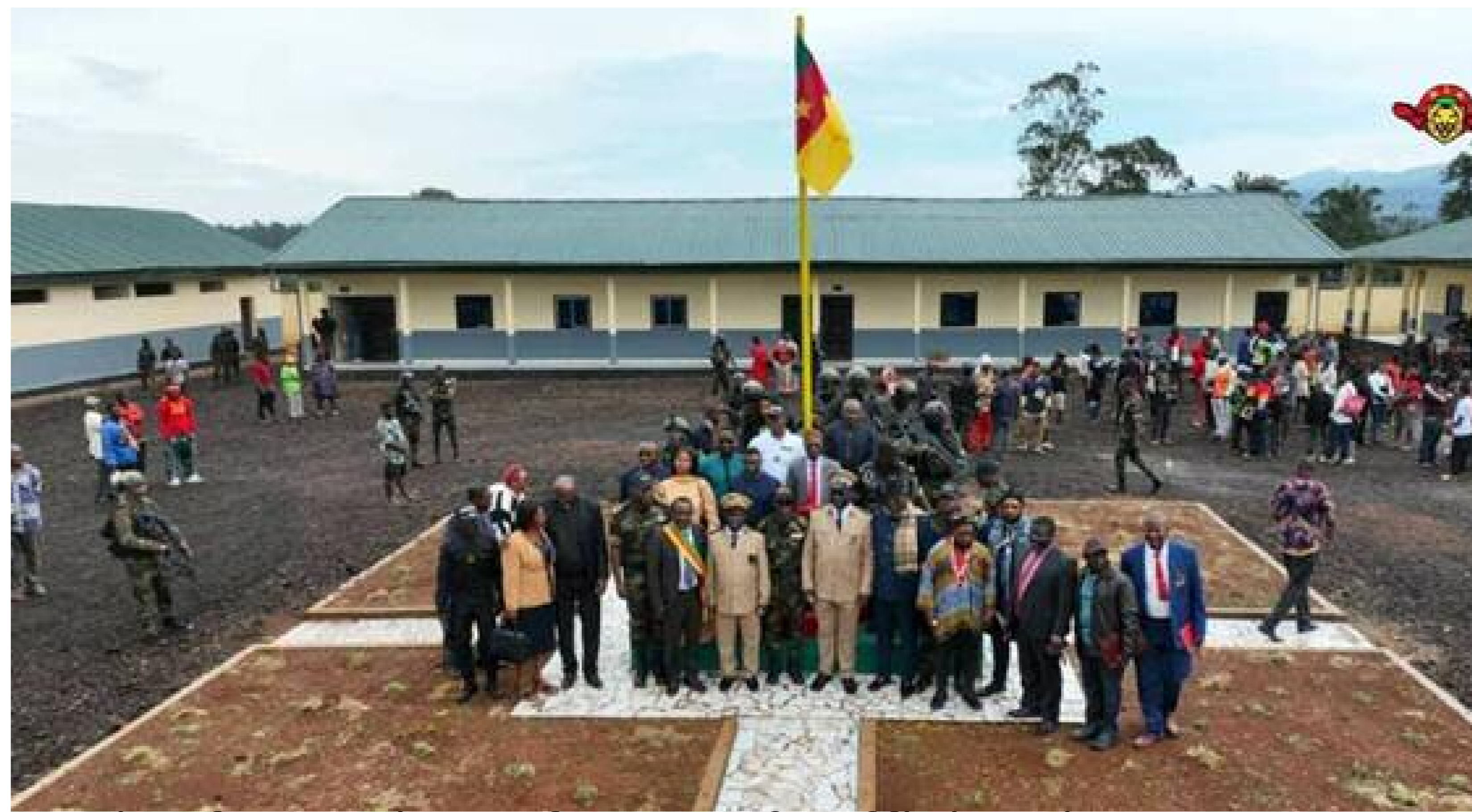
aerial front view of camp & officials in group photo

He urged them to work closely with the defence forces, including by providing useful intelligence and denouncing any suspicious behaviour.