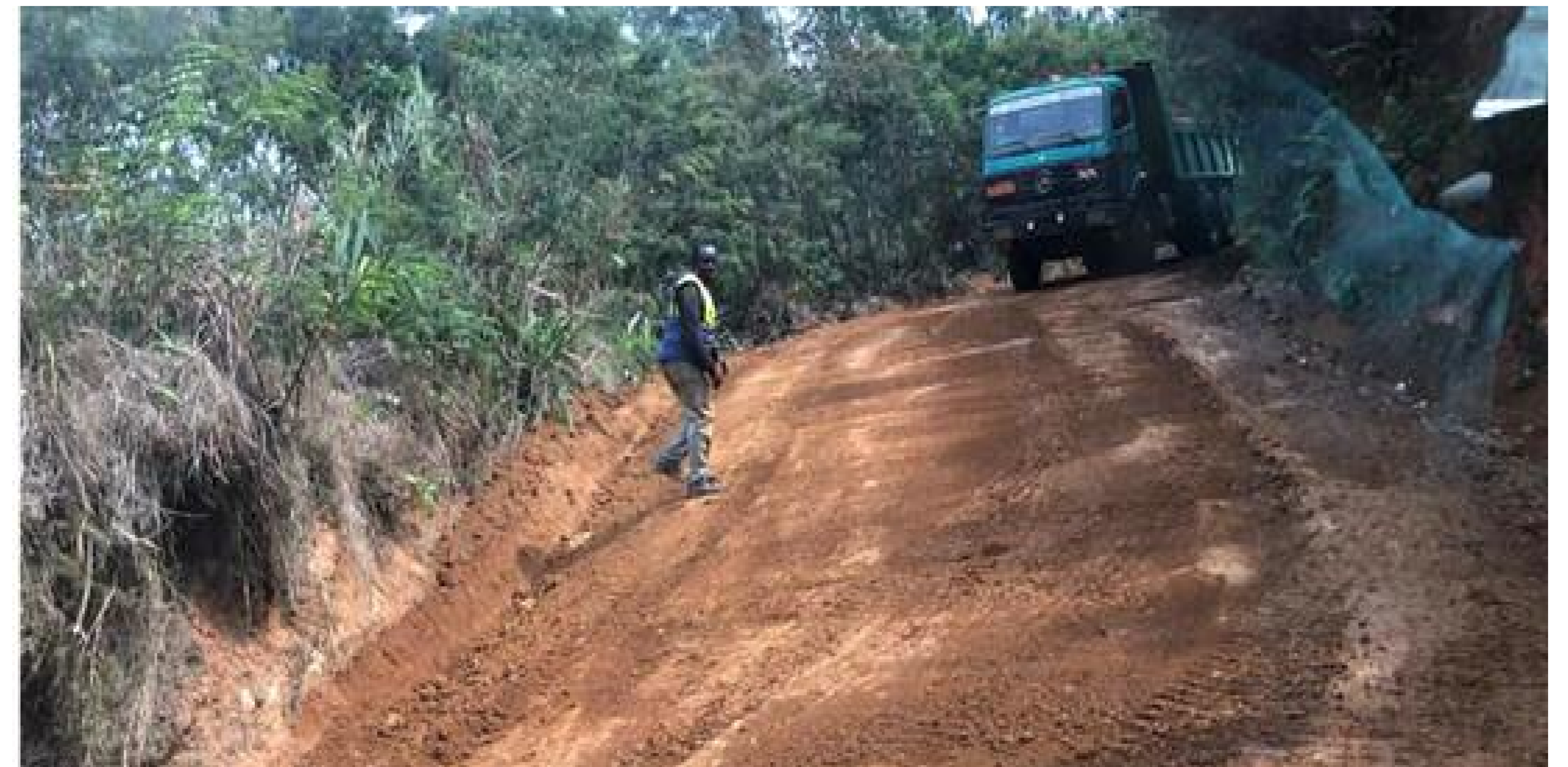
Stretch of the road under construction