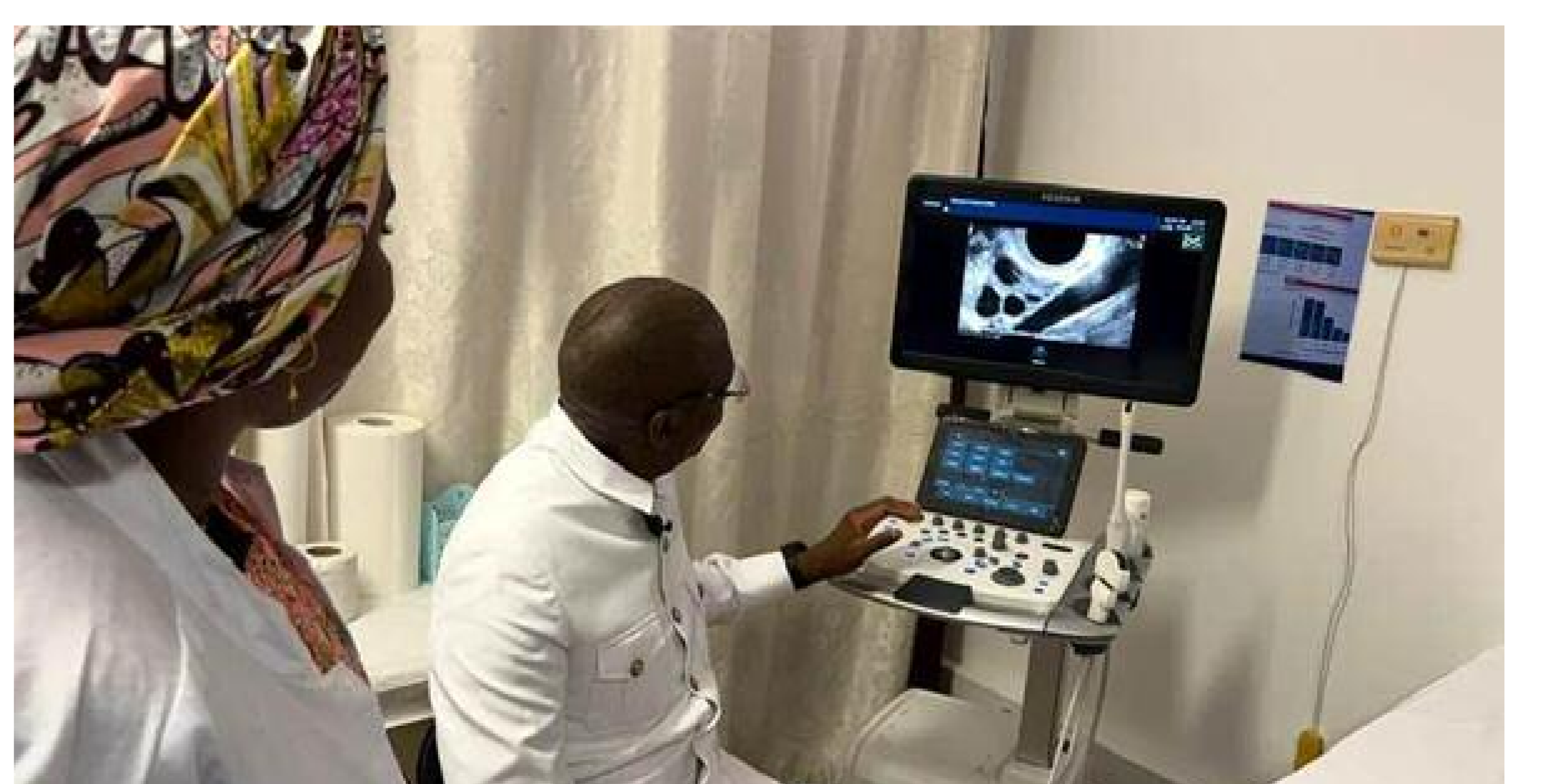
Health Minister at Douala Gynaecology, Obstetrics & Paediatrics Hospital

In addition, public health messaging has