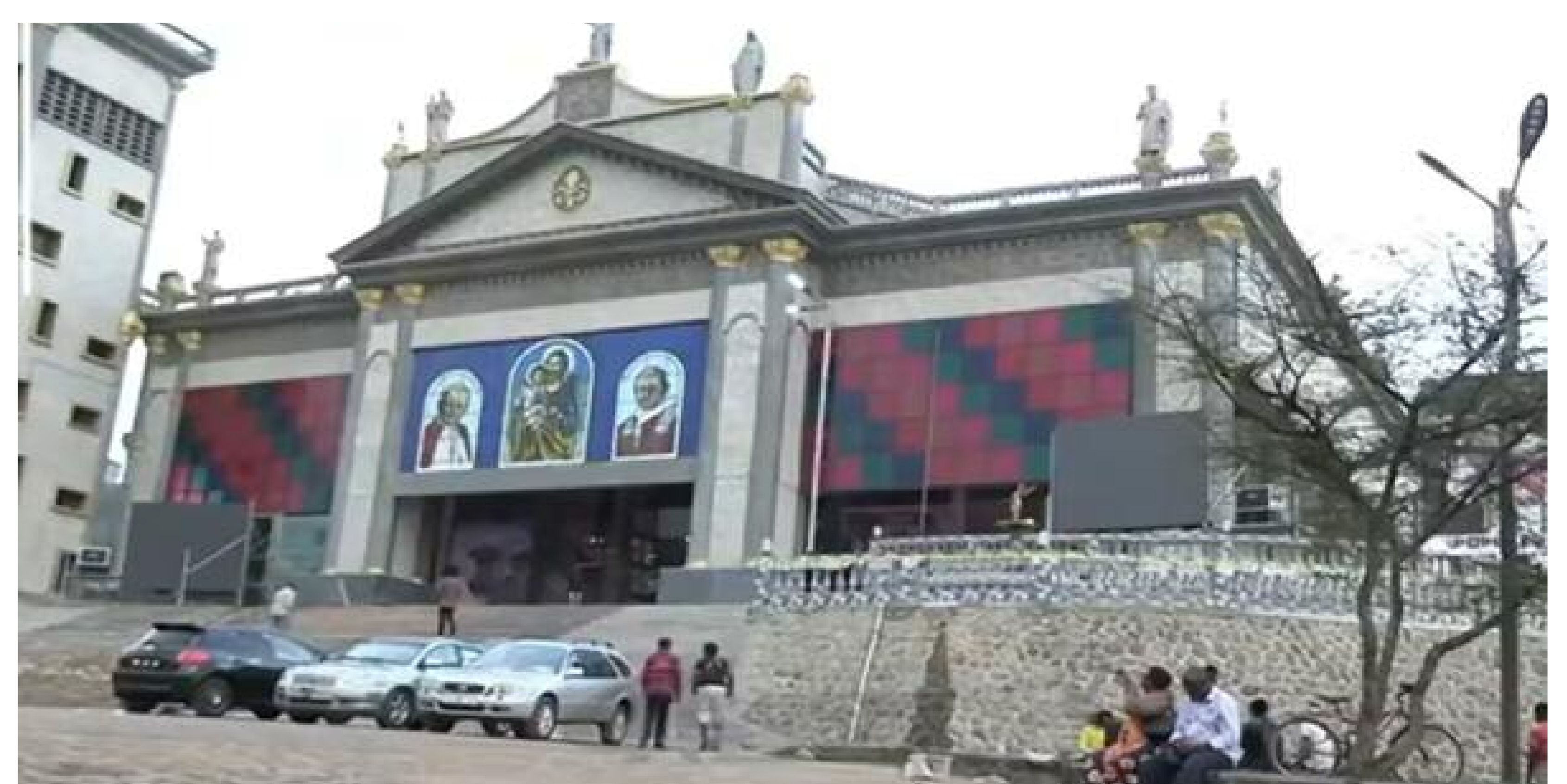
Partial front view of B'da Metropolitan Cathedral ready to welcome the Pope