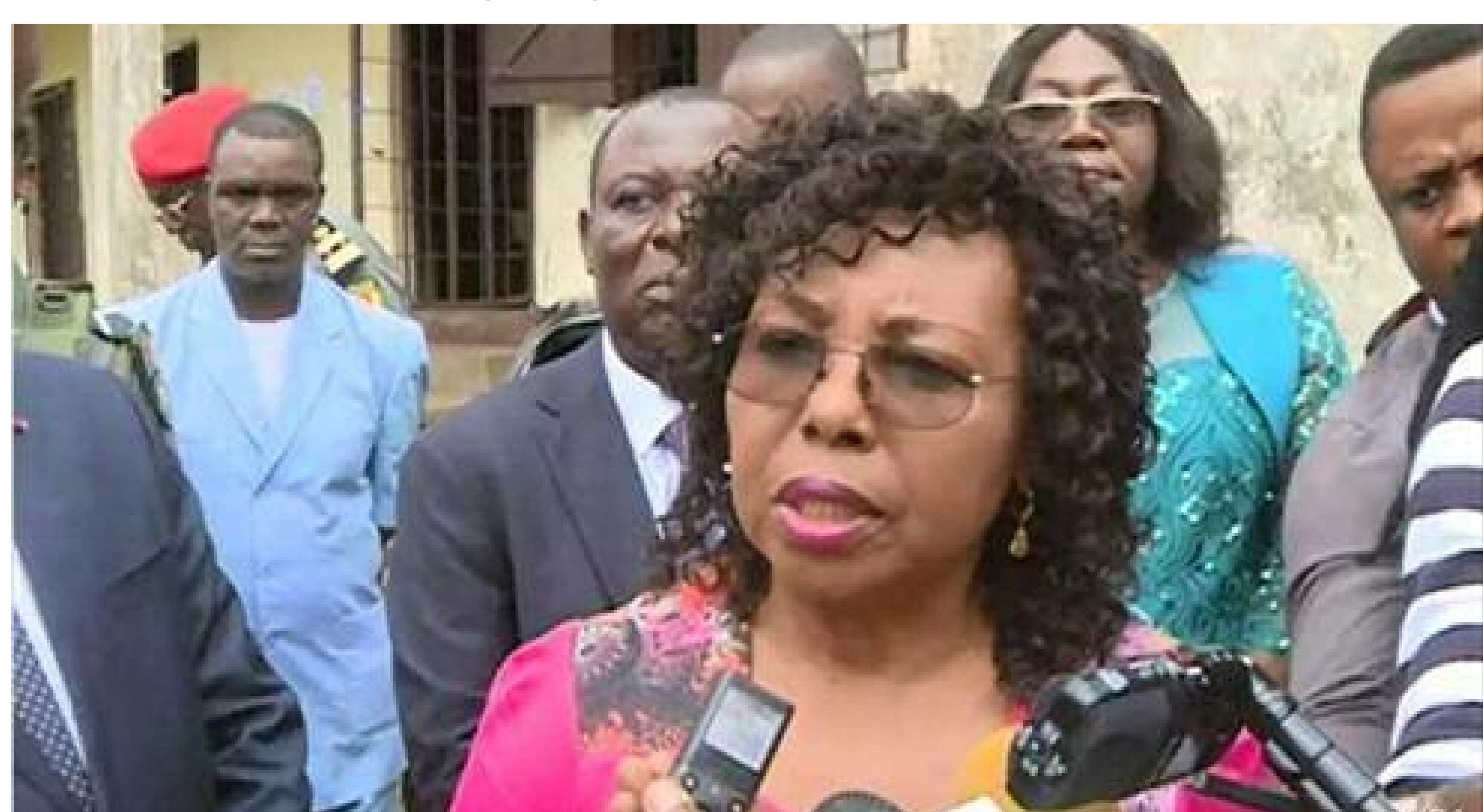
Prof Nalova Lyonga, Minister of Secondary Education

The adjustment comes as the school year enters its final phase, under the framework set by the joint order issued in August 2025 by the ministries of Basic and Secondary Education.