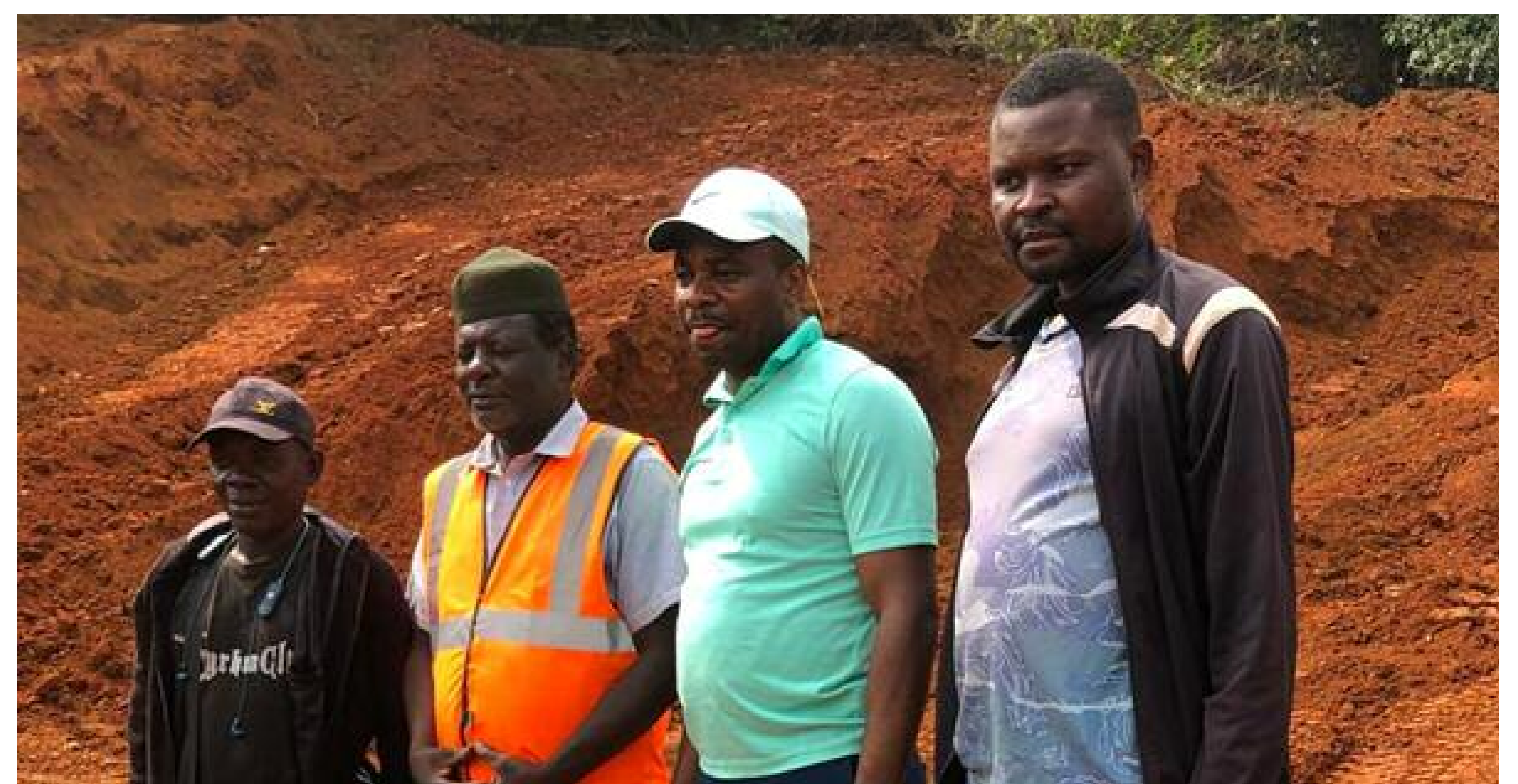
LECUDO USA CEO pose with some of the road construction workers during visit