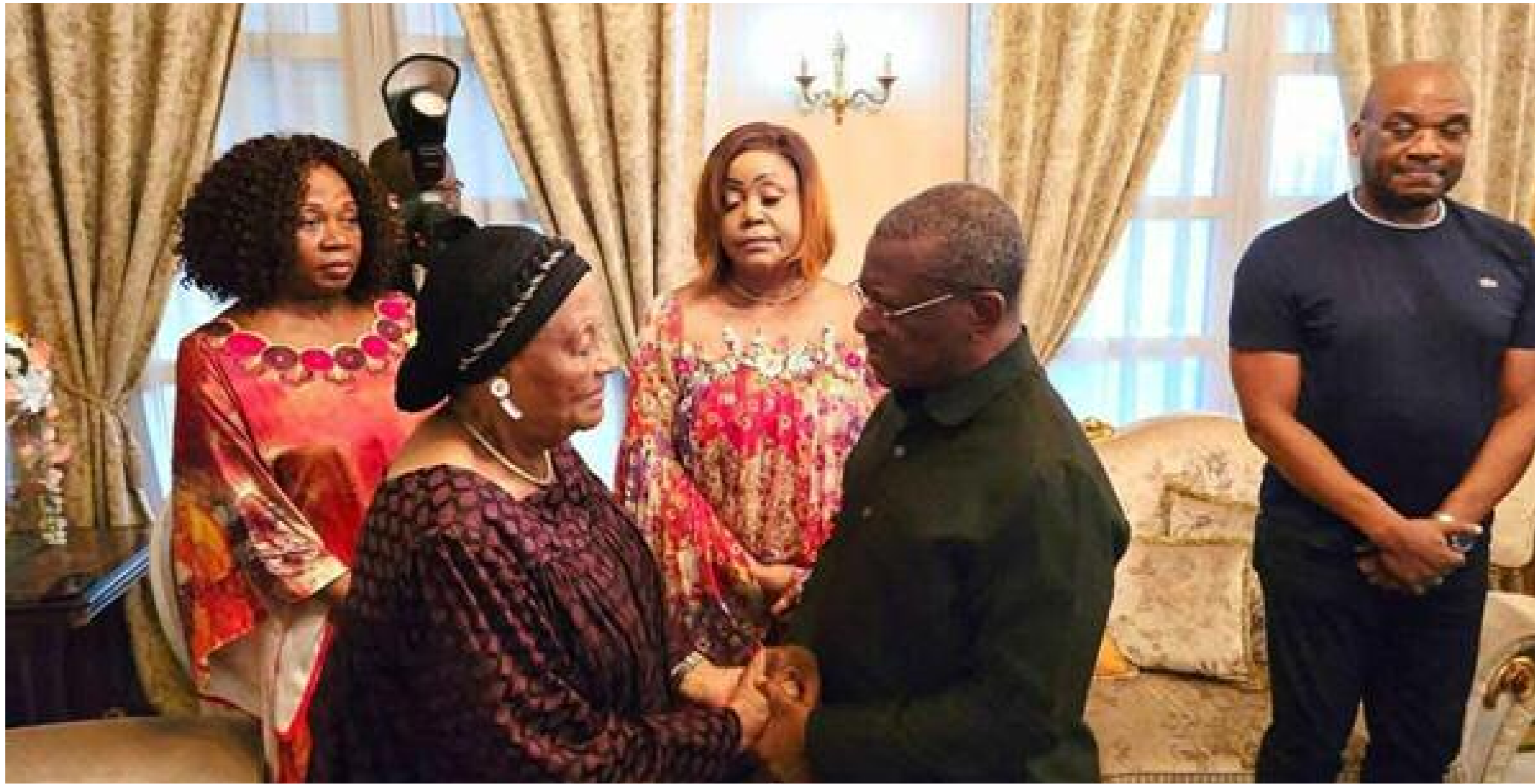
PM Dion Ngute consoling wife of late Niat Njifenji

He began his career in the Cameroonian civil service in 1960 as civil engineer.