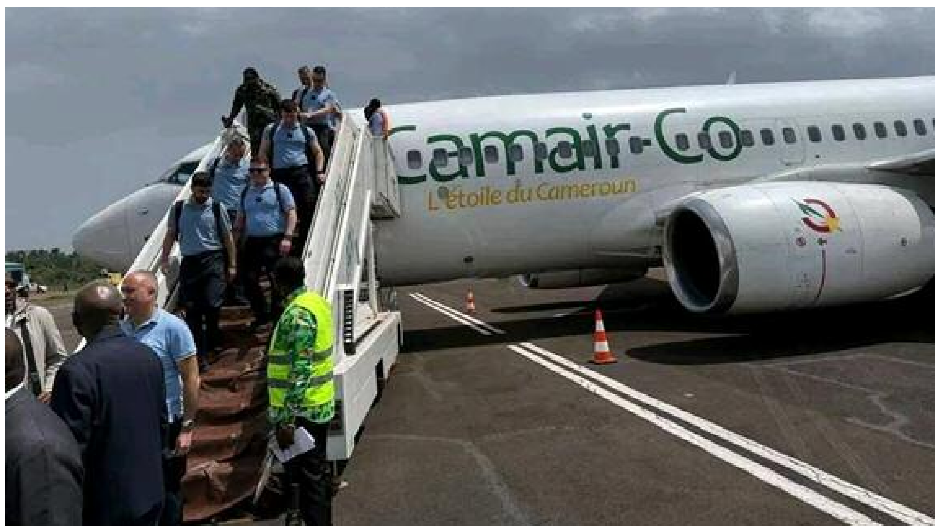
Vatican's elite Swiss Guards touch down in Bamenda

Technicians from the state broadcaster, CRTV have also been working on site, installing equipment to ensure smooth TV and audio signals.