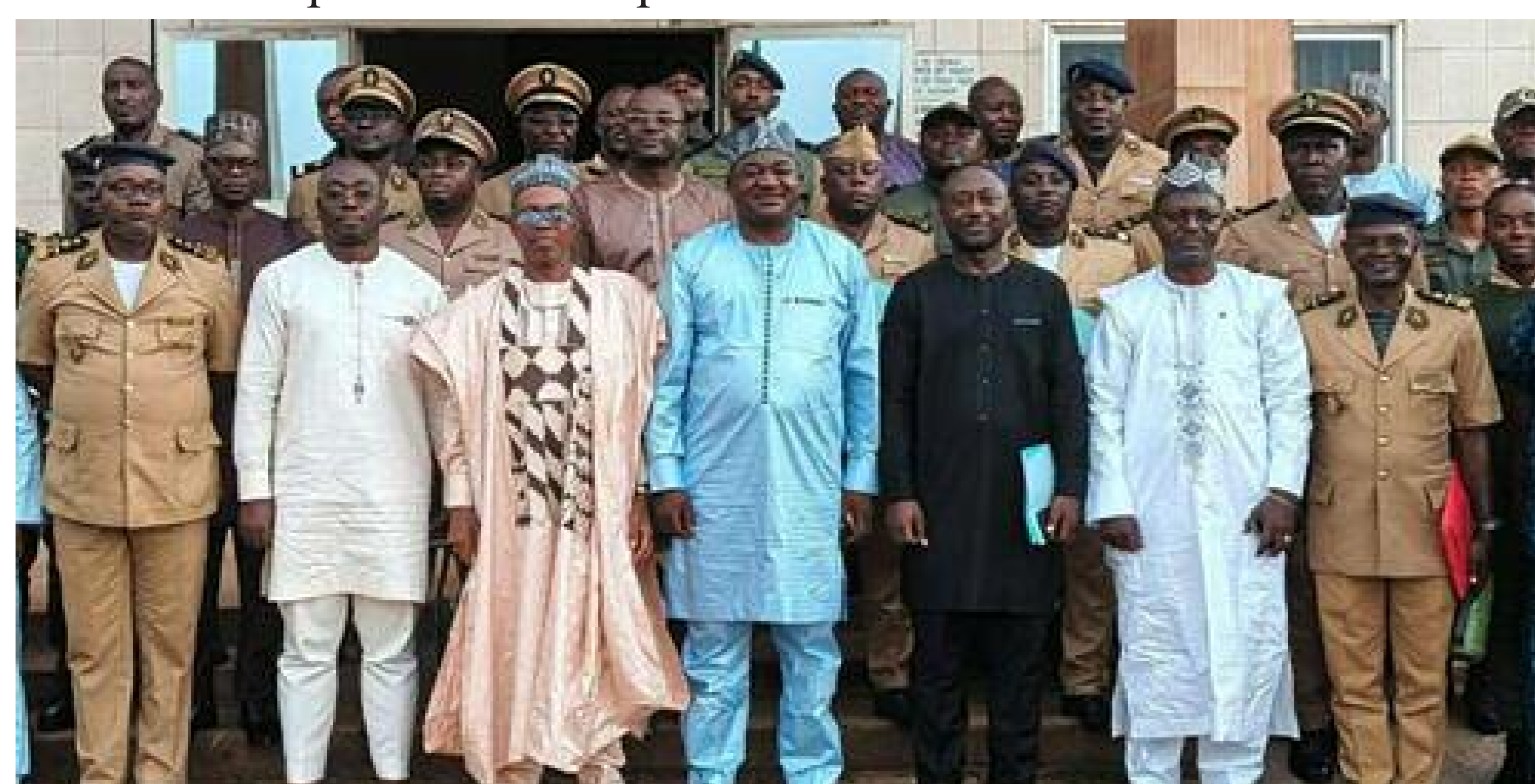
Officials in group photo after opening of joint working session

Government recently ordered the cessation of activities in all sites where semi-mechanised mining was taking place in the East and has rolled out new conditions to be met by those who intend to carryout mining activities henceforth.