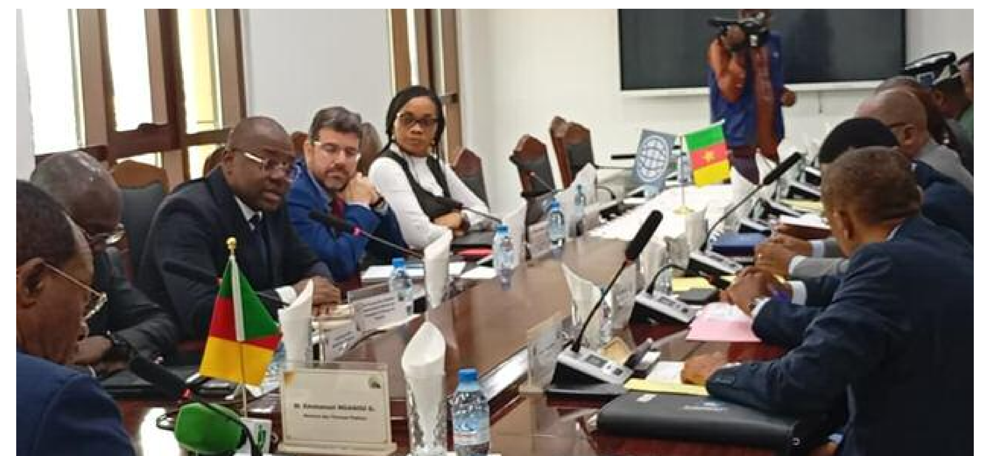
Works minister chairing meeting with World Bank Mission

However, it was revealed during the meeting that securing financing remains a crucial challenge but at moment, Cameroon has already secured commitments from several partners, including the World Bank, the French Development Agency, the European Union, the European Investment Bank, and the Islamic