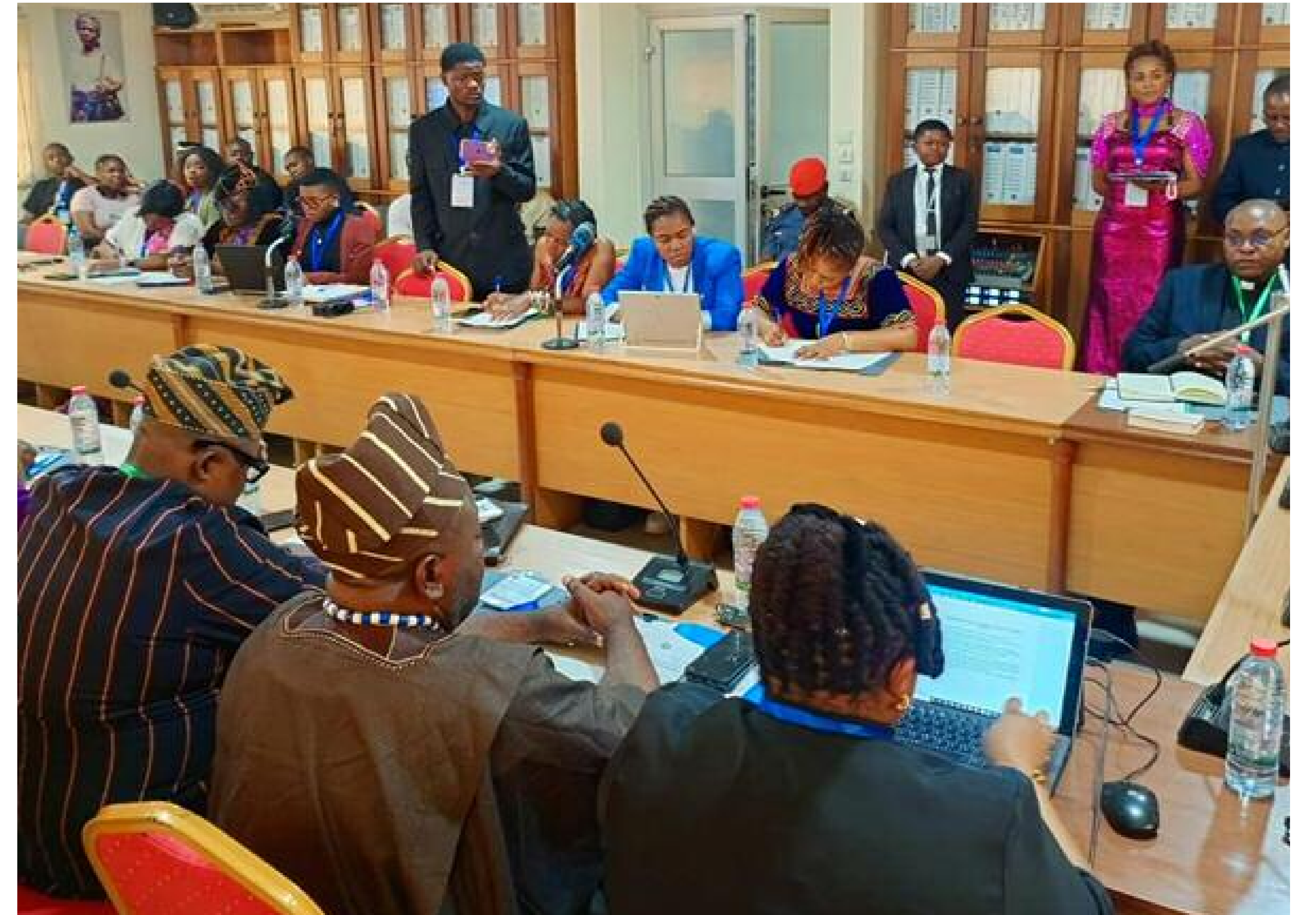
Cross section of participants during the workshop

In the final presentation, Prof. Willibroad Dze-Ngwa spoke on the need for "a broad-based, inclusive and participatory engagement in